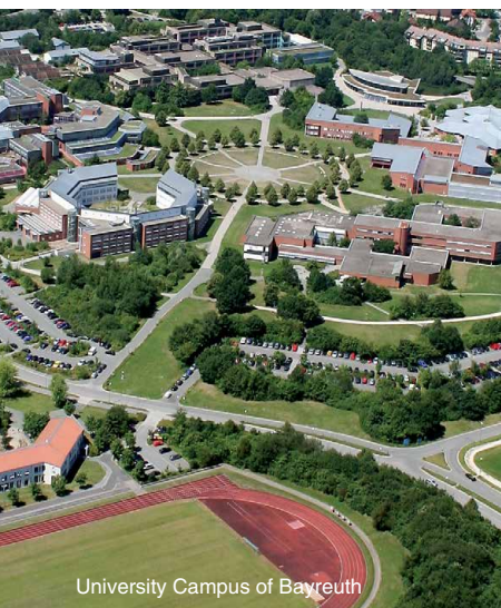
University Campus of Bayreuth

The town's roots date back to the year 1194 and Bayreuth now has a population of about 72,000 citizens and about 11,000 students at its university. The town is world-famous for its annual festival “die Bayreuther Festspiele” at which operas by the 19th century German composer Richard Wagner are performed. Located in the heart of